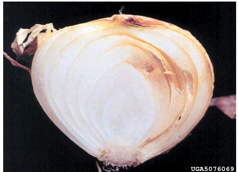
Figure 3. Bulb rot symptoms of sour skin caused by Burkholderia cepacia .

In Georgia, sour skin usually manifests itself during harvest in the latter portion of the Vidalia onion-growing season when temperatures are warmer, but being temperature-dependent, symptoms can occur earlier if warmer conditions prevail. The disease may progress from the upper foliage to the lower leaves and then to the outer scales of the bulb. Infected bulbs develop a cheesy or slimy yellow growth between scales and then a dark brown soft rot (Figure 3). Infected scales may separate from adjacent scales, allowing firmer inner scales to slide out when the bulb is squeezed. Bulbs infected with sour skin usually have an acrid, sour, vinegar-like odor and other foul odors that may be associated with secondary organisms. Initially, bulb tissues may appear translucent, but over time, they will turn reddish-brown to brown in color as tissues rot and copious amounts of fluids are produced. Sour skin primarily affects onion bulbs, but B. cepacia has been reported in some onion-growing areas as infecting foliage through leaf axils. In those cases, this phase of the disease has been referred to as bacterial canker of onion or “soreshin.” Typically, soreshin is not observed in Georgia, but nonetheless, it is likely that bacteria may colonize the plant in this area as an epiphyte where it may wash down to the bulb and bulb neck.