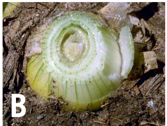
Figure 7. An onion plant displaying symptoms of slippery skin in the foliage and bulb caused by Burkholderia gladioli pv. allicola ; A: white and bleached leaves with soft-rot symptoms (both central and lateral leaves can show these symptoms); B: soft-rot symptoms in bulbs—in severe cases liquefaction of tissue can occur with foul odor.