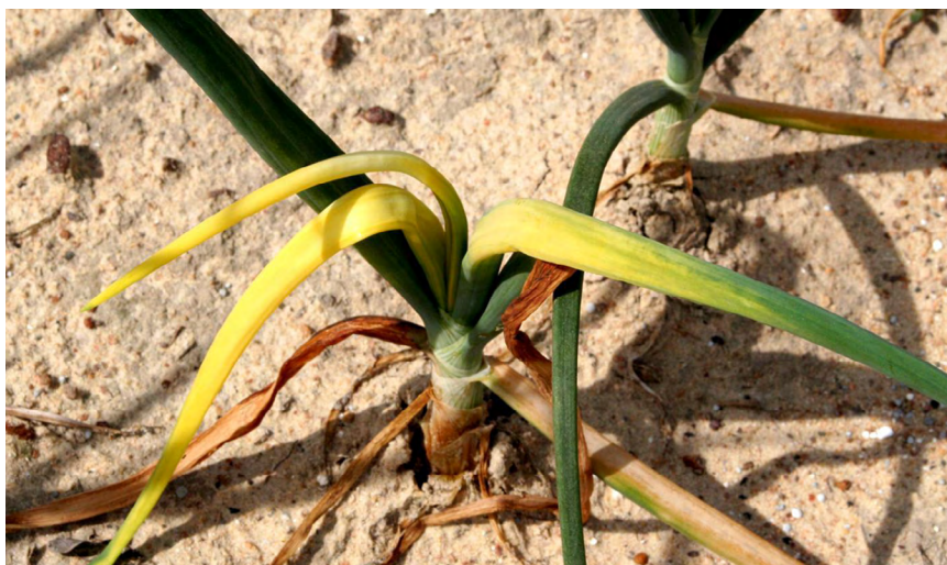
Figure 4. Foliar symptoms of yellowbud disease on onion caused by Pseudomonas coronafaciens . Note the intense chlorosis on emerging leaves and severe blight on the older leaves.

because yellowbud symptoms have not been observed in other onion-growing regions where P. coronafaciens pv. porri occurs. However, environmental conditions may play a role, as P. coronafaciens pv. porri has mainly been isolated from blighted, long-day onions, which are typically produced under warmer conditions than what is experienced during a typical Georgia onion-growing season. Nonetheless, the yellowbud bacterium is a strong