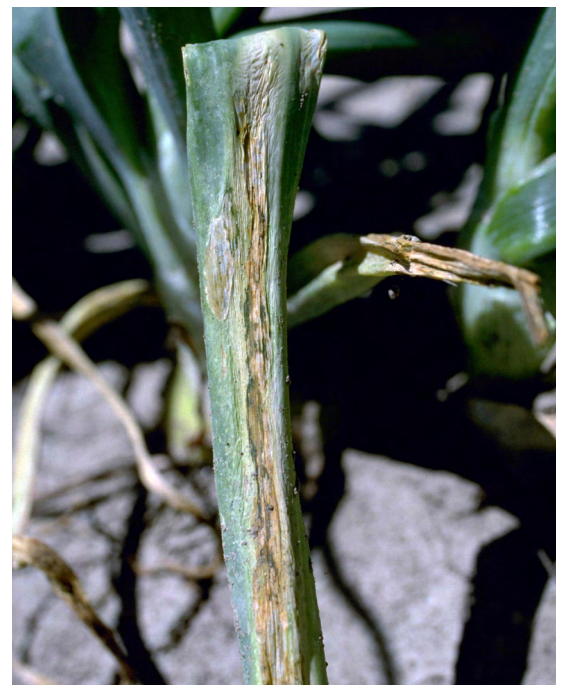
Figure 5. Foliar symptoms of bacterial leaf blight of onion caused by Xanthomonas axonopodis pv. allii .

In Georgia, Xanthomonas leaf blight caused by X. axonopodis pv. allii is usually observed in seed beds when temperatures are warm in the late summer or early fall. It is rarely observed during the winter. Interestingly, it is rarely a problem in the spring, even when the temperatures become more favorable.