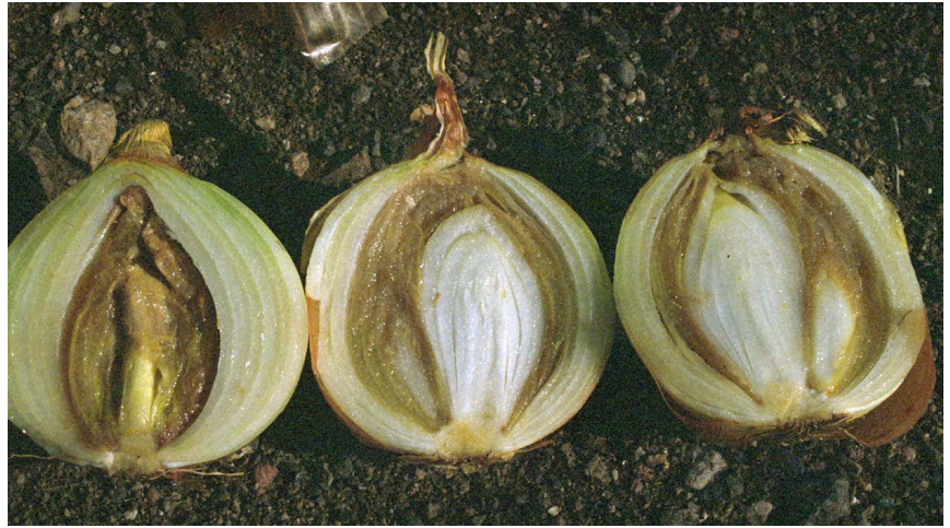
Figure 6. Onion bulbs sliced open to reveal damage by infection with Enterobacter cloacae .

Slippery skin, caused by B. gladioli pv. allicola , has a disease cycle similar to sour skin (Figure 7). Both organisms are soilborne, so crop rotation may be of some benefit, but unlike sour skin bacterium, less is known about the interaction of this bacterium with other crops. It is also less prevalent than sour skin. It is unknown whether it survives on foliage and is affected by copper sprays in the same manner as B. cepacia , but until more knowledge is gained, recommendations for controlling slippery skin are the same as those for sour skin.