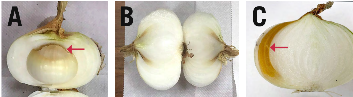
Figure 8. Onion bulbs showing symptoms of bulb rot caused by Rouxiella badensis ; A: Bulb with rot of central core tissue; B & C: Brown scale necrosis.

A common practice with all of these diseases is to use good sanitation practices in seed beds, production fields, and packing houses. It is especially advisable to carefully handle and sort onions to avoid placing infected onions in storage where they will promote secondary rots. Figure 9 features a generalized timeline depicting the risk of different bacterial diseases during onion-growing season.