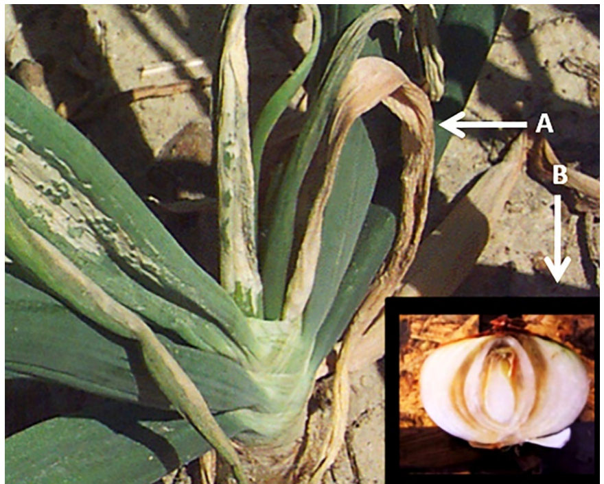
Figure 1. Symptoms of center rot on an onion's foliage and bulb. A: The leftward arrow points to a white, bleached, water-soaked, necrotic lesion on foliage. B: The downward arrow refers to an interior necrotic lesion and bulb rot associated with onion scales.

Foliar symptoms initially consist of water-soaked lesions that expand and span the length of the leaf blade, causing the leaf to become bleached and blighted. As the disease progresses, severe wilting and blighting of foliage can occur, leading to complete foliage collapse and the death of aboveground plant tissues. Bacteria move from foliar tissue into the bulb, causing bulb decay, which has been demonstrated experimentally with Pantoea ananatis , one of four Pantoea species that have been associated with center rot. Additionally, Carr et al. (2013) observed that the specific bulb scale showing symptoms could be traced back to the corresponding infected blade (Figure 1). Therefore, the authors concluded that protecting onion leaves can reduce bulb rot incidence.